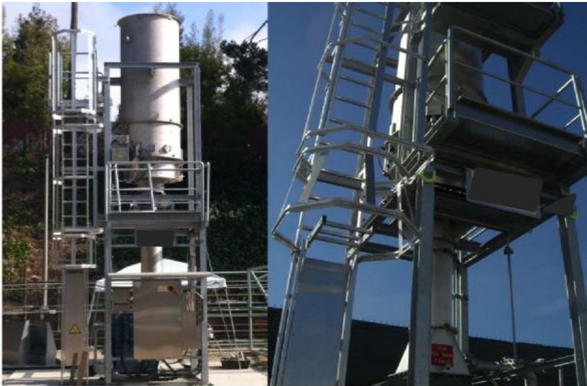
CEB® 1200 at an Oil Exploration Site